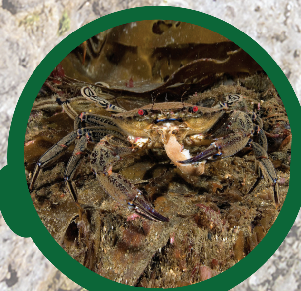
Velvet Swimming Crab